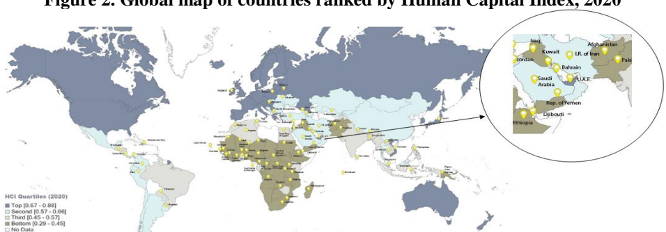
Figure 2. Global map of countries ranked by Human Capital Index, 2020